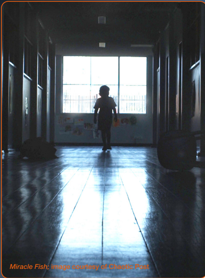
Miracle Fish

Larney adds, "Our SCRATCH suite is fed directly via dual, 4Gb/s fiber channels from a 16TB SAN RAID array, providing around 500MB/sec transfer rates. This allows us to playback and record 2K uncompressed DPX sequences in real time, providing enough storage and speed for pretty much any project we can throw at it. We also have 24TB of networked RAID storage as general working space for the facility. All this is backed up onto LTO-3 tapes via our 24-bay and 16-bay LTO-3 tape loaders. Footage plays out through a Quadro FX5600 HD-SDI card."